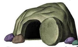
They have taken the Lord!